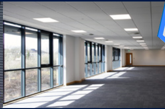
Imagery and site plan for illustration only.